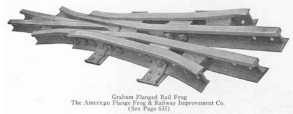
Graham Flanged Rail Frog The American Flange Frog & Railway Improvement Co. (See Page 633)

Picture from 1921 Maintenance of Way Cyclopedia American Switch & Signal version